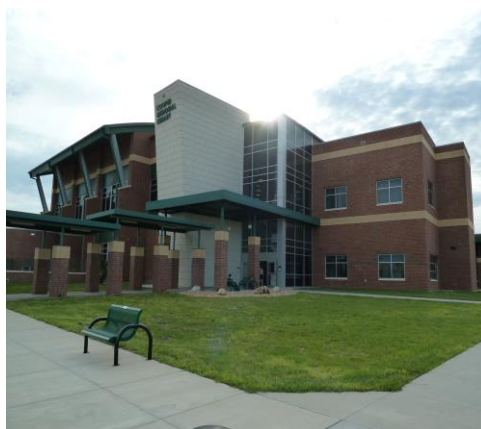
Cooper Memorial Library