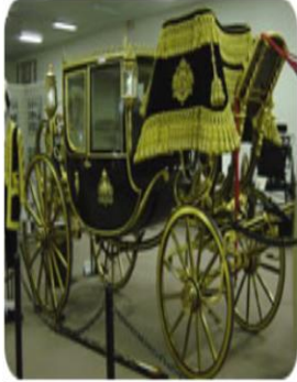
(One of the many carriages on display at the Grand Oaks Museum).